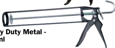
Heavy Duty Metal - 380ml