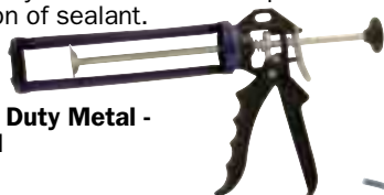
Heavy Duty Metal - 310ml

Extremely robust and ideal for continuous use. Will not twist under pressure, ergonomically designed to reduce operator fatigue. Very smooth action for optimum application of sealant.