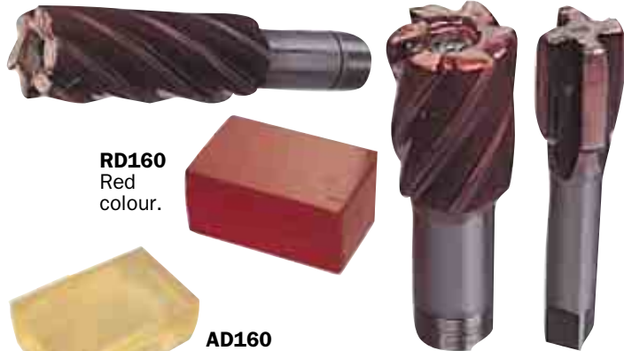
RD160 Red colour.

Hot dip strippable plastic coating moulds itself around the component or tool being coated to provide 100% coverage and protects against corrosion and impacts, for up to ten years. The component protected can be easily identified through the translucent coating. Simply removed by peeling it off, leaves behind a thin oil film to provide short term protection against corrosion. The removed protective dip can be reused. Never directly apply heat to melt the protective dip, always use with a suitable melting pot. Working temperature 130°C to 160°C (for optimum results 140°C to 145°C).